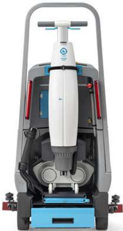
i-drive + imop Lite