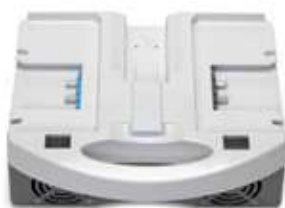
i-charge 9 (3 pieces)